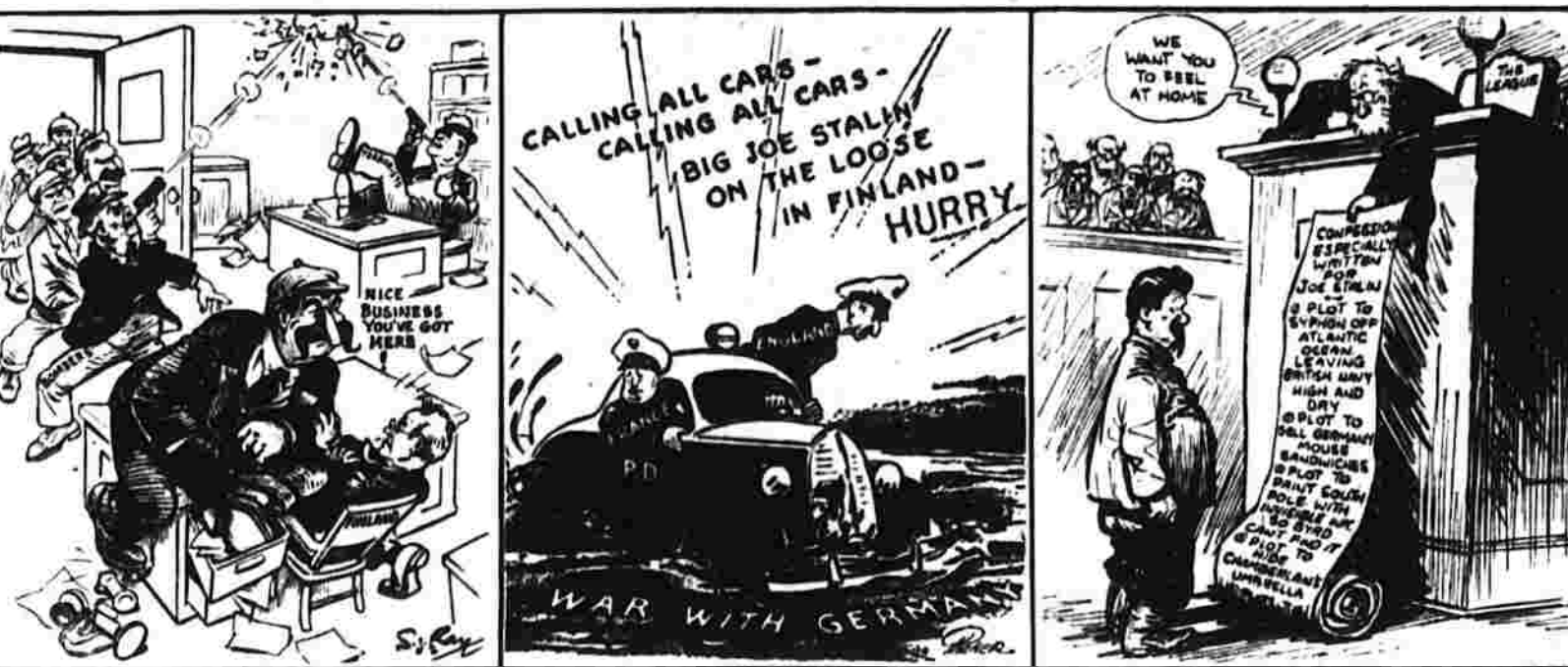
1. The Crime: A Crack At Russia 2. The Cops: A Crack At The Allies 3. The Trial: A Crack At The League

As The Cartoonists, Turned Police Reporters, Write Current History